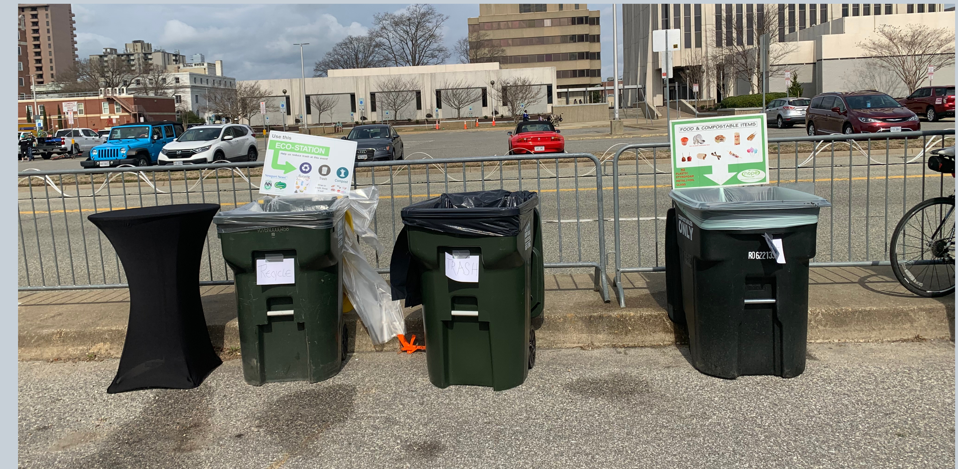
ECO-Stations, Left to right: Recycling, Trash, Composting