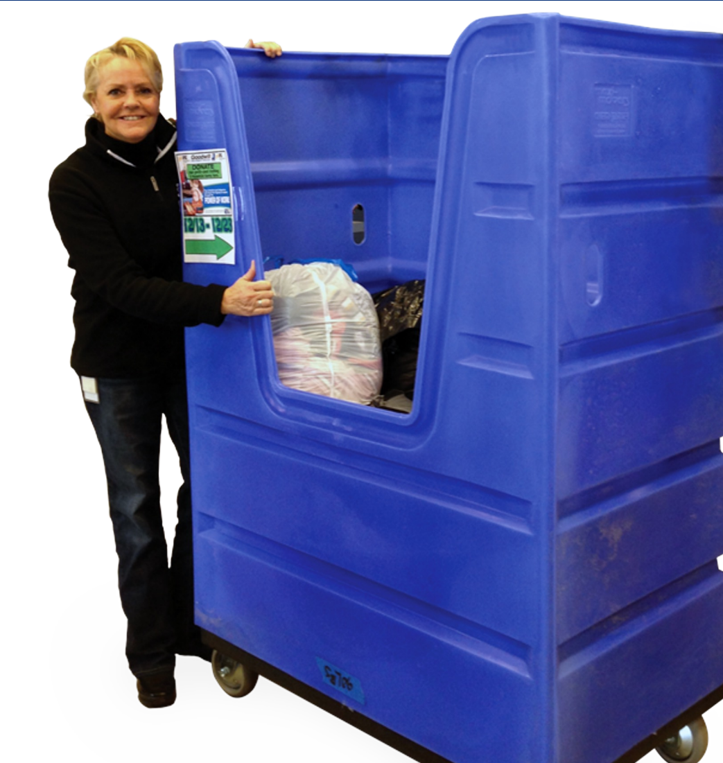
Figure 2. Goodwill employee with Tall Blue Bin (TBB). TBBs are to be placed in Freshman and Sophomore Residence Halls (see Fig. 3).